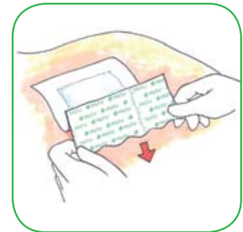
The part with exposed adhesive is applied to the skin. Remaining protection paper is removed. Firmly smooth Mefix to obtain proper adhesion.