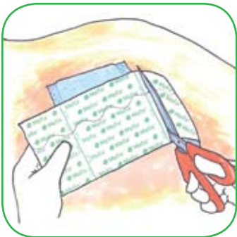
Cut to appropriate size.