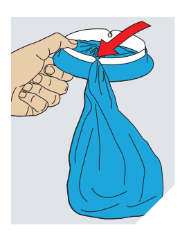
3. Secure —grip the bag 3-4 inches below the comfort ring and twist the ring. Tuck the tightly twisted bag into a notch on the ring to hold. Dispose of in a sanitary manner.