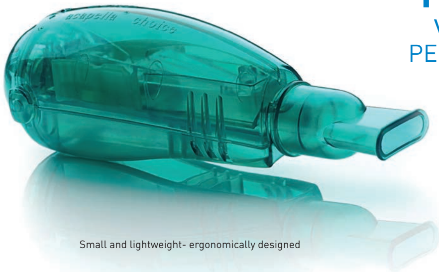
Small and lightweight- ergonomically designed