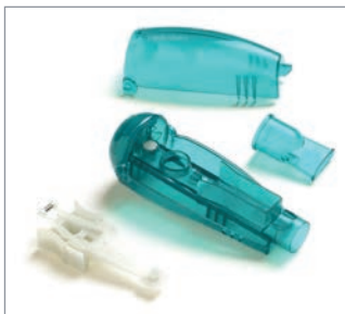
Easily disassembled for cleaning - dishwasher safe