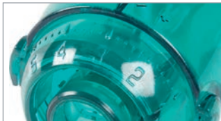
Up to 20 variable resistance settings with fixed settings from 1-5 for high- and low-flow patients