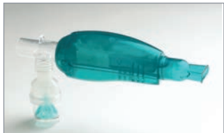
Connect to nebulizer via tee adapter (distal 22mm O.D. fitting)