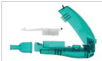
Patented magnetic rocker. Required patient expiratory flow rate \geq 10 L/min