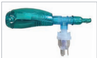
Connect to nebulizer via tee adapter (proximal 22mm O.D. fitting)