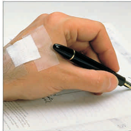
4 General Dressing