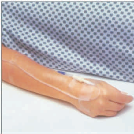
3 Peripheral IV tubing